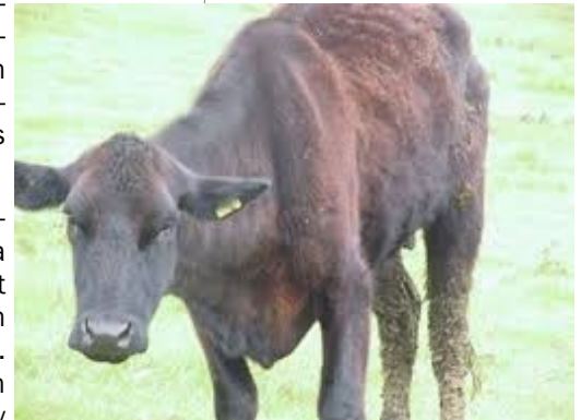
FIGURE 4: Beef cow with Johne's disease.