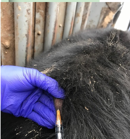
FIGURE 1: Caudal fold testing for tuberculosis.